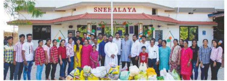
SVP, ICYM, YCS MEMBERS PERUVAI PARISH