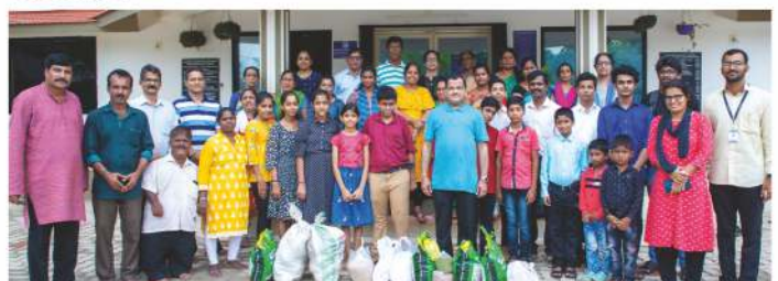
MOTHER TERESA WARD MEMBERS OF BONDEL PARISH