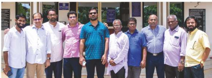
DON BOSCO FATHERS