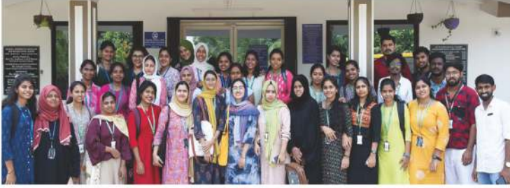
STUDENTS OF YENENOYA MSW DEPT