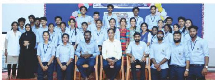
MSW STUDENTS OF MANGALORE UNIVERSITY