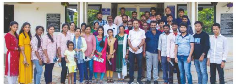
MEMBERS OF RO CORPORATION VAMANJOOR