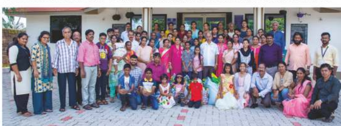
CATHOLIC SABHA & WOMEN ASSOCIATION MUKKA PARISH