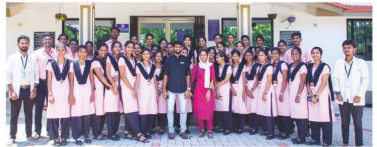
SHREE DEVI NURSING COLLEGE STUDENTS