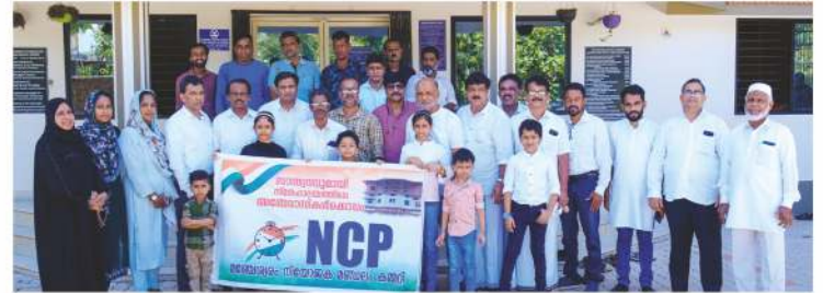
NCP MANJESHWAR BLOCK MEMBERS