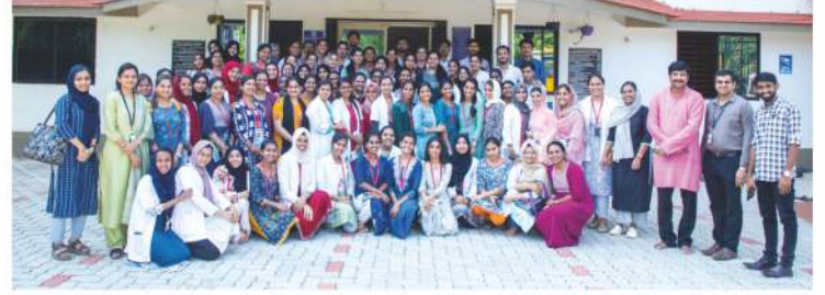
STUDENTS OF YENENOYA AYURVEDA COLLEGE