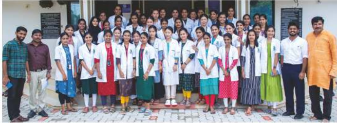
STUDENTS OF YENEPOYA NURSING COLLEGE