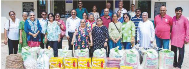
SENIOR CITIZENS BENDUR PARISH