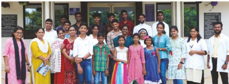
PARISHIONERS OF INFANT JESUS CHURCH HOSANGADI