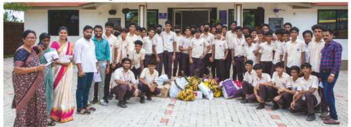
MEMBERS OF CLC PUTTUR PARISH