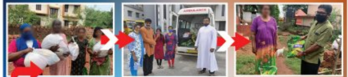
Food kits to HIV affected and poor families