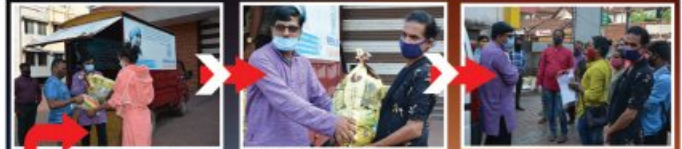
Kit distributed to Navasahaja members