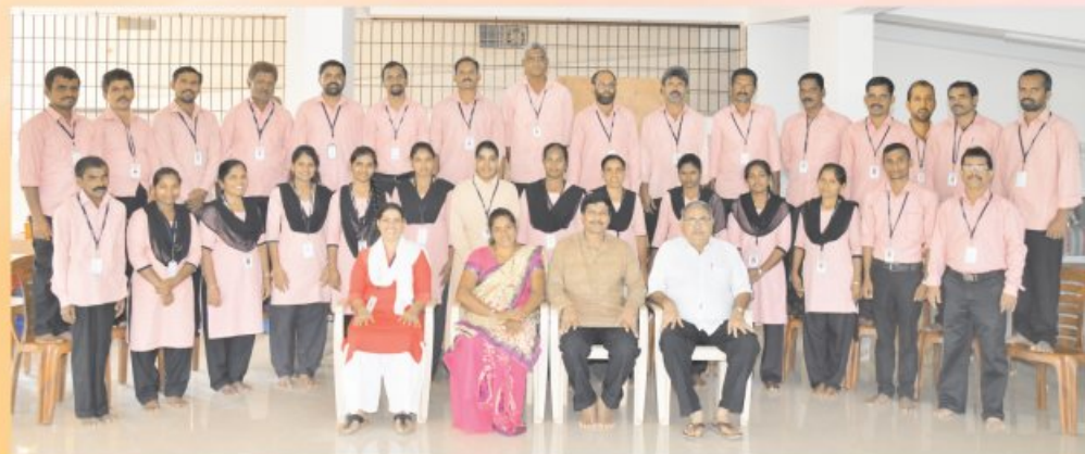
Dedicated Staff of Snehalaya